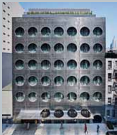
Handel Architects' Dream Downtown Hotel opened last year in New York City.