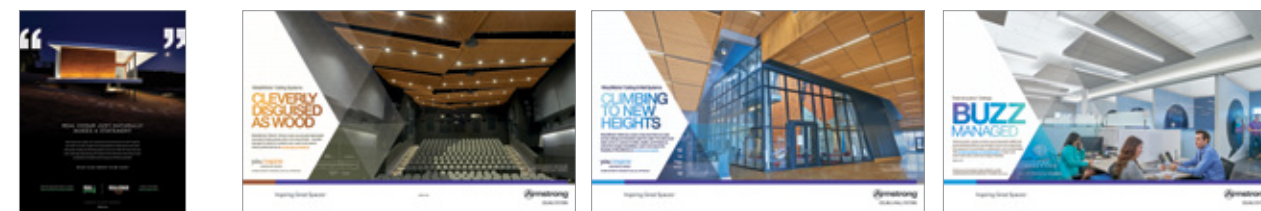
12 13 14