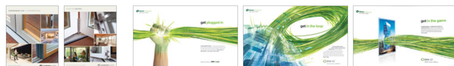
15 16 17