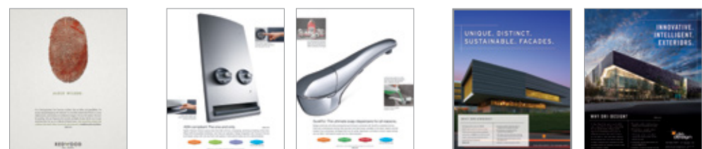
05 06 07